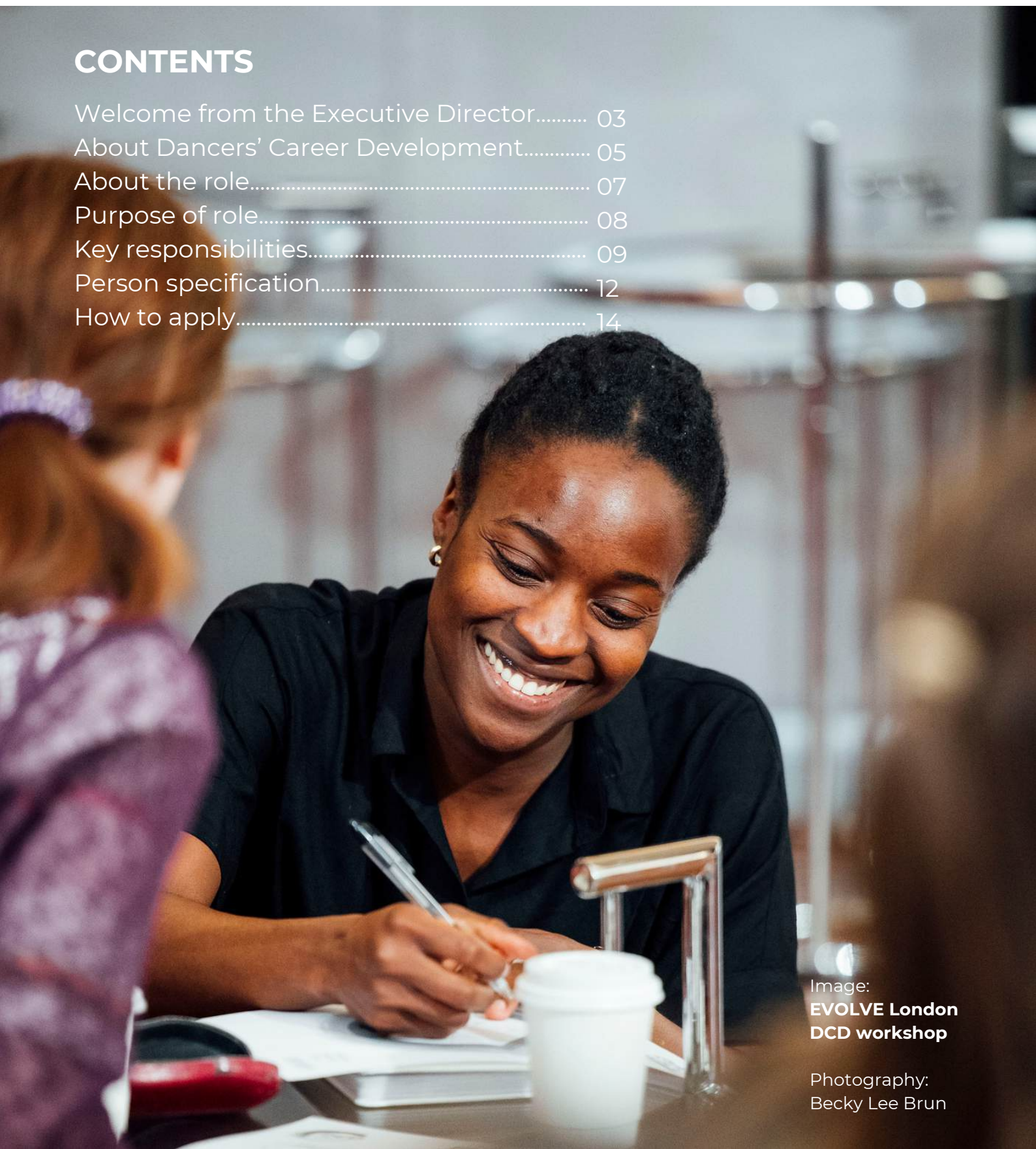
Image: EVOLVE London DCD workshop