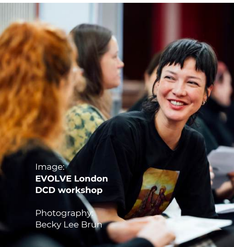
Image: EVOLVE London DCD workshop

We are open to applications from former dancers who do not meet all the essential criteria but are able to explain and demonstrate how their previous experience, skills and knowledge can be successfully applied to enable them to excel in this role.