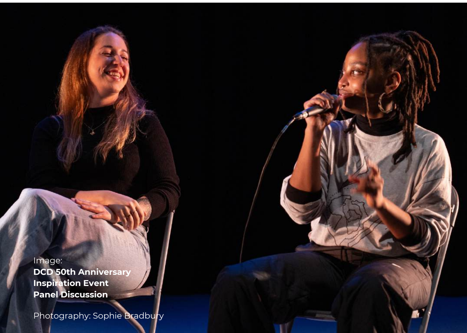
Image: DCD 50th Anniversary Inspiration Event Panel Discussion

Relationship Managers work collaboratively with DCD staff, external facilitators, speakers and stakeholders to ensure a consistently high standard of service to the dance community we serve.